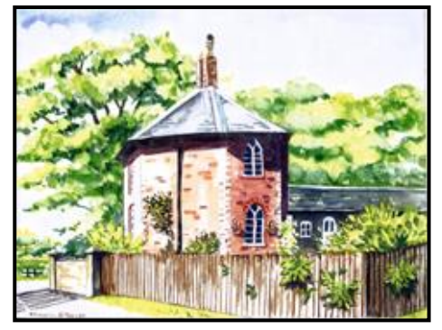
The Round House Teddesley Hay