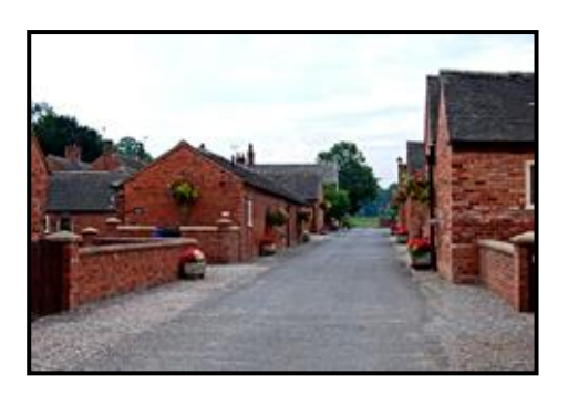
Teddesley Hay - Modern Housing in an Old Setting