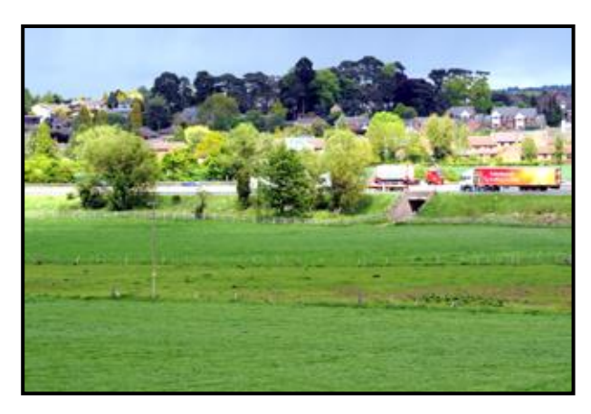
Acton Trussell behind the M6 Motorway

The motorway also led to the development of several businesses around the junction, including a Motel, a Public House, a Restaurant and the Argos Distribution Centre