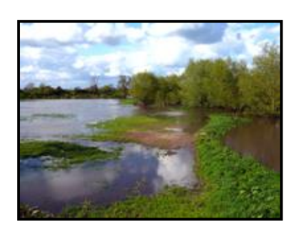
Mill Lane Flood Plain

The Staffordshire & Worcestershire Canal, the only canal wholly completed by James Brindley, runs to the west of Acton Trussell. The towpath and the network of local footpaths give a variety of local walks in, around, and through the parish.