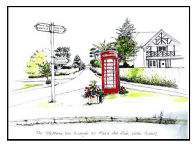
Acton Trussell Telephone Box

Recently, as part of the Parish Plan, moves are being made by the Parish and District Councils to formulate, produce and maintain an appropriate parish-wide web site. However, a number of residents have again expressed concern regarding the lack of speedy broadband communication.