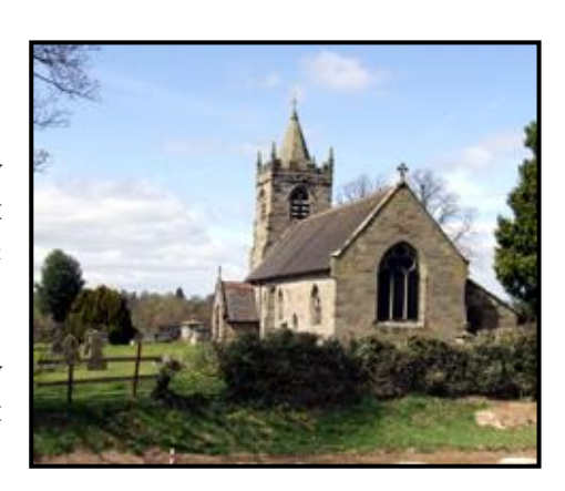
St James' Church Acton Trussell

Particular parts of the Parish are mentioned in the Doomsday Book (1086) whilst other parts, have in the past, formed part of the Royal Forest of Cannock (from before 1100).