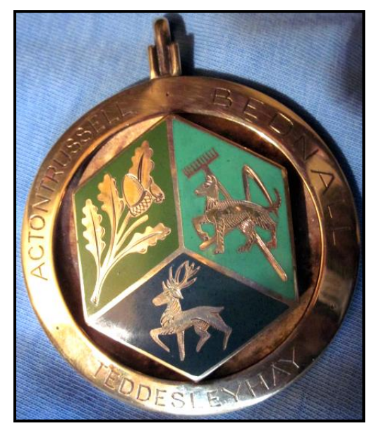
The Parish Medallion

The "BATTH PLAN" is the Parish Plan for the next 10 years for the future development of the combined community of Bednall, Acton Trussell, and Teddesley Hay. It has been prepared by a small group of volunteers following wide-ranging consultations throughout the Parish. As such the "BATTH PLAN" represents a shared vision for our Parish as a whole.