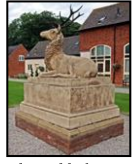
The Teddesley Stag

Teddesley Hay is now a hamlet within the Parish but in 1252 it was part of the Parish of Penkridge for tithe purposes and was part the Royal Hunting Forest of Cannock Chase.