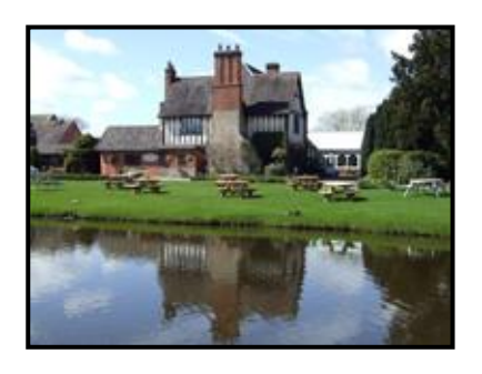
The Moat House

The Moat House in Acton Trussell was originally a farmhouse. It has been owned by the Lewis family since 1955, and it is now a luxury hotel and conference centre.