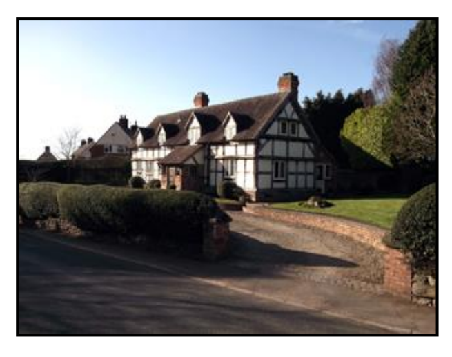
The New 'Old' House in Bednall

As a result of consultations and work undertaken by the BATTH PLAN Focus Group, the Parish Council re-entered both Acton Trussell and Bednall into the appropriate categories of the 2013 "Best Kept Village" competition. This helped engage village communities in a sense of pride in the appearance of their respective villages. It also encouraged the Parish Council to invest in appropriate facilities to maintain a better outlook. As a result greater cohesion was noted. Bednall came third in their category and Acton Trussell was highly commended, a credit to both villages. This will continue to be encouraged in future years.