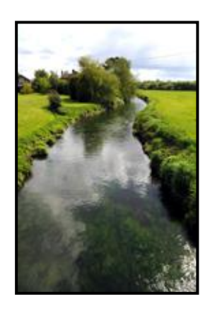
The River Penk