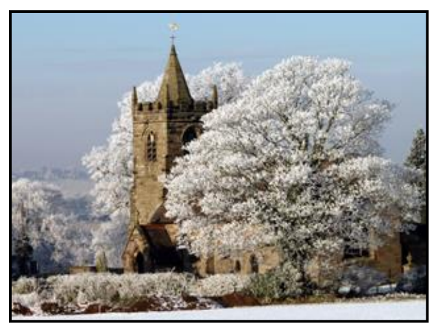
The Parish Council has notice boards in all three villages.

The church produces a monthly magazine for the whole parish, to which residents are invited to