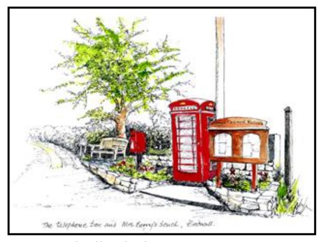
Bednall Telephone Box

Telephone services are reasonably good. However broadband connections are at best extremely variable. Whilst recent improvements by BT have led to better fibre optic connections, particularly in Acton Trussell, full connectivity throughout the Parish is still variable.