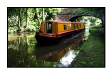
Teddesley Canal Bridge

Cannock chase, the canal and nearby River Penk provide the opportunity for recreational activities such as walking, cycling, horse riding and fishing to name but a few.