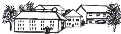
A Acton Gate Business Park