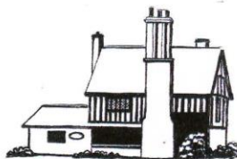
C Moat House Hotel