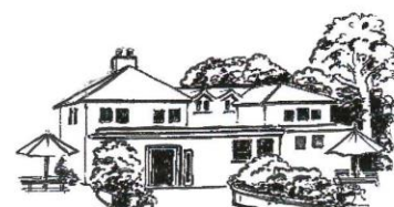
I Springslade Lodge Cafe