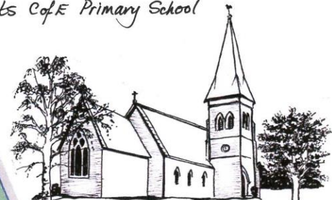
H All Saints Church