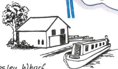
E Teddesley Wharf