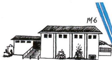
B Community Centre