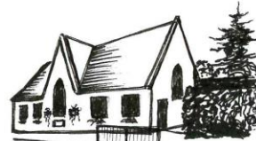
G All Saints C of E Primary School