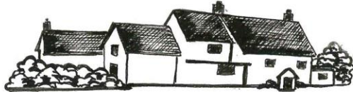
F Seven Stars Public House